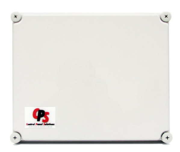
EVD 4 Panel: 2 x Twin Driver Panel for up to 4 EEV's