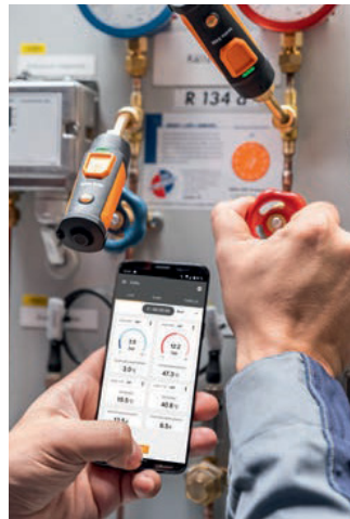
Tightness test on refrigeration plants