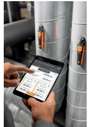
Refrigeration and heating performance of air conditioning plants